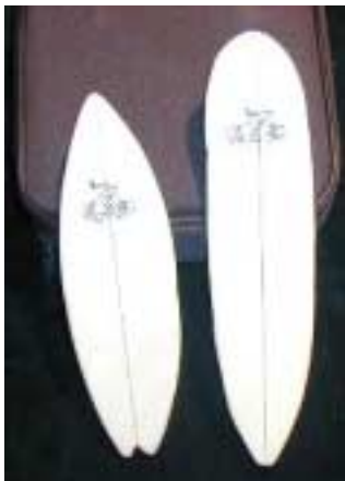
ASC Sacrificial Boards

Best main course dish, best dessert dish, best female costume, best male costume.