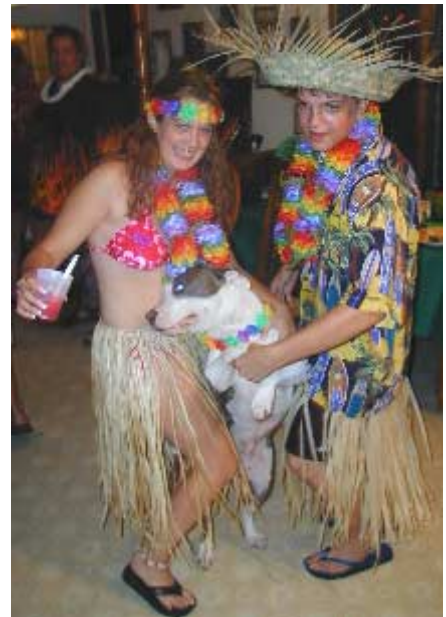
Even Pets Can Have Fun

discriminate between longboard and short; make two instead.