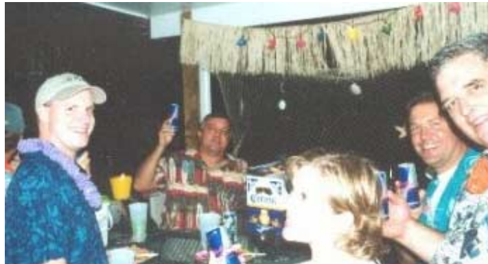
Bar With Deck Lights and Decorations

One thing you really need to consider near your bar or in your party area is lighting. I use four different things to add light. The golden rule is never use a simple white light outside if possible. It will draw bugs, mosquitoes, and an occasional bat, at least if you live in this area. Some of my friends (and myself) use small Christmas tree like lights. These can be white, and are strung along the