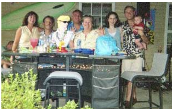
Key West Party Goes Around an Interesting Centerpiece Used as the Costume Winner Award

Recently, I've also decided I really like having someone volunteer a shift to mix margaritas, daiquiris, and rum drinks at a bar. I went to Singapore last