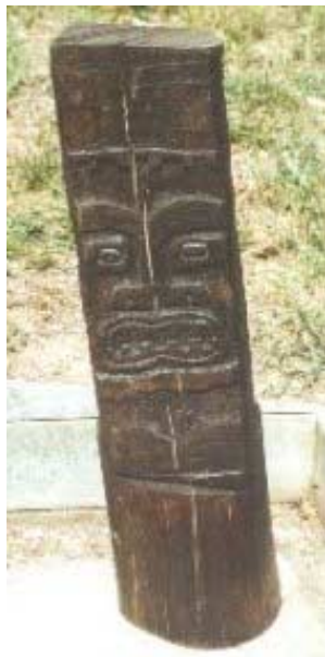
My Entry Way Tiki

main dish prize with Pigs in a Blanket cooked in a pineapple flavored sauce that was tremendous. Basically, anything goes on the dishes.